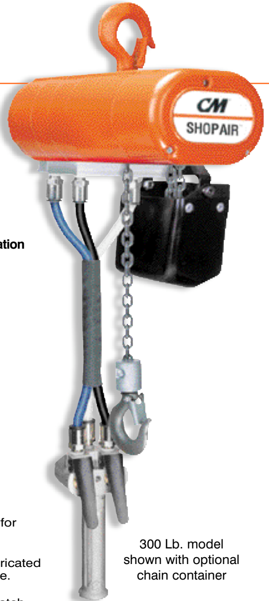
300 Lb. model shown with optional chain container