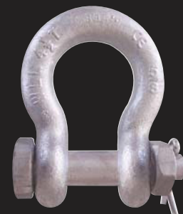
Bolt, Nut & Cotter