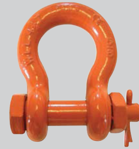
Bolt, Nut & Cotter